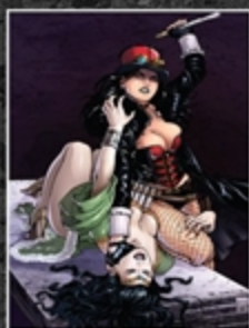
COVER A RICHARD ORTIZ ALESSIA NOCERA

On one side of the Shadowlands, the Being has quelled the wars between the monsters trapped in this realm, joining them into a single army that is united for his own mysterious purposes. On the other side, the hunters have reunited in Roman's cabin. As hordes of monsters surround them, they have no choice... it's escape, or die.