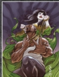
COVER C GIUSEPPE CAFARO RUBEN CURTO